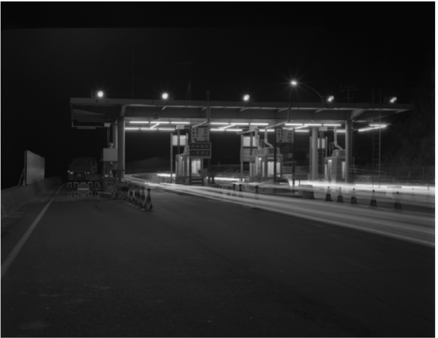
Fig. 4 Toshio Shibata, Night Photo , Shonan Toll Gate, Zushi City, 1982