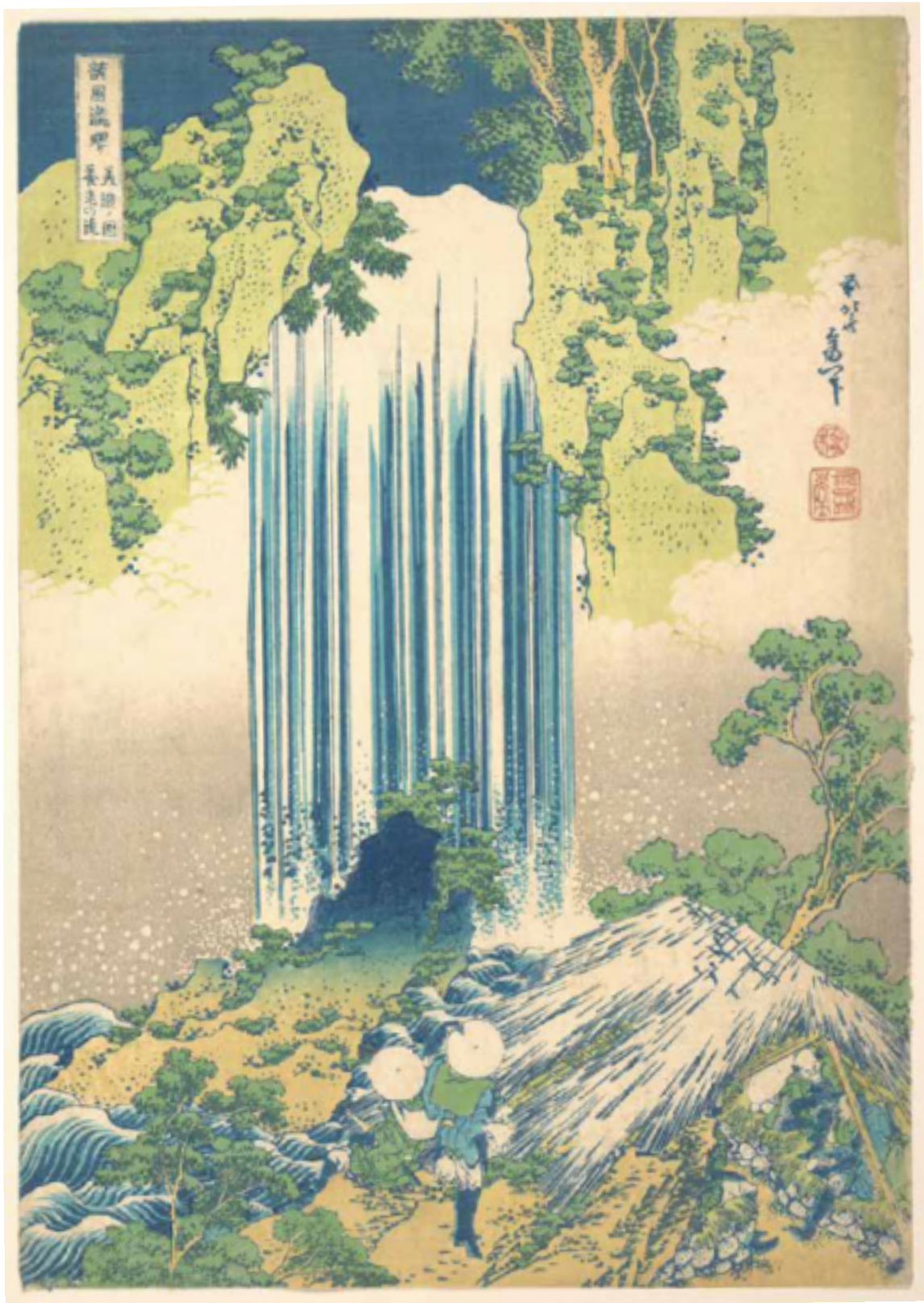
Fig. 5 Katsushika Hokusai (1760–1849), Yoro Waterfall in Mino Province , ca. 1832, woodblock print, from the series A Tour of Waterfalls in Various Provinces