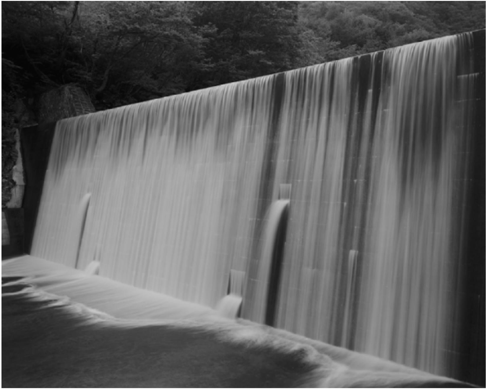
16 Kuroiso City, Tochigi Prefecture, 1989