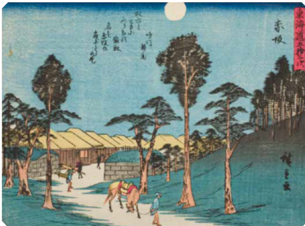
Fig. 3 Utagawa Hiroshige (1797–1858), Akasaka , 1832–33, woodblock print, from the series Fifty-three Stations of the Tokaido , printed ca. 1837–42

Shibata's night photographs gave way to an intense period of invention, from the late 1980s until 2003, during which he focused exclusively on black-and-white photographs