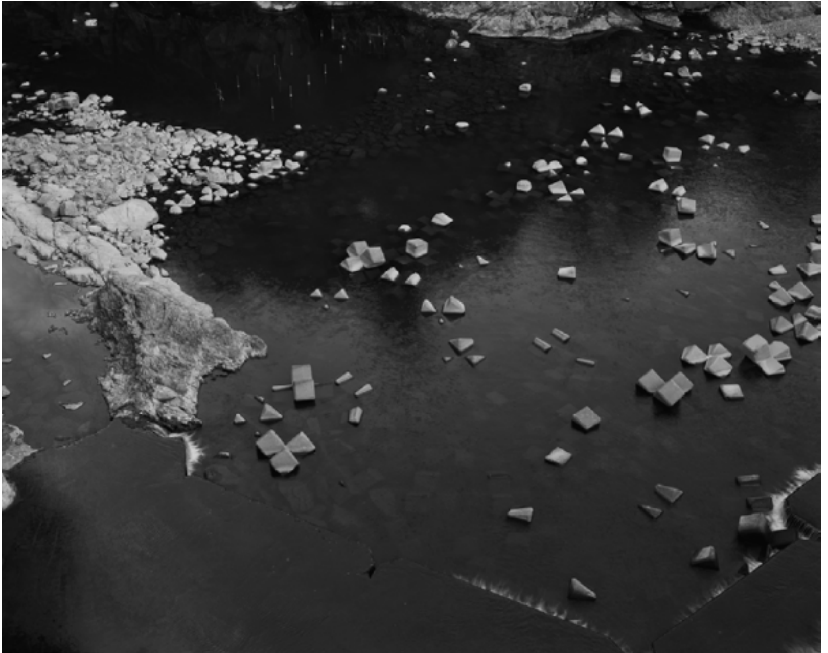
Shimogo Town, Fukushima Prefecture, 1990