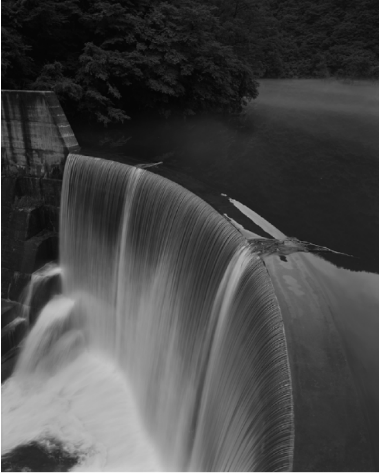
Kashima Town, Fukushima Prefecture, 1990