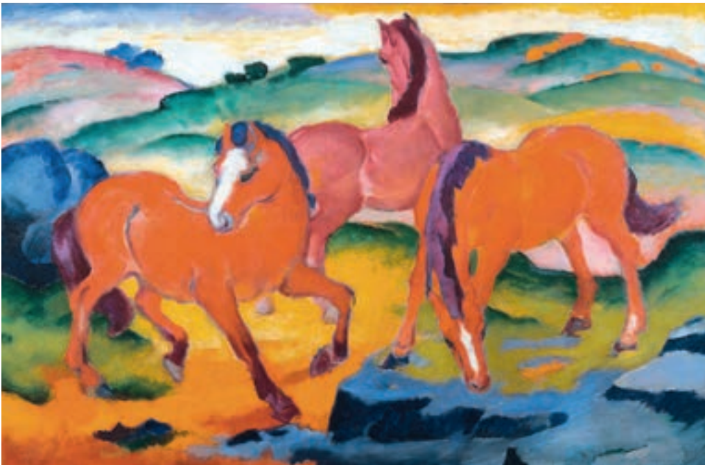
4 Franz Marc, Grazing Horses IV (The Red Horses) 1911, oil on canvas. Harvard Art Museums/ Busch-Reisinger Museum. Bequest in memory of Paul E. and Gabriele B. Geier, 2014.301.

More decisive than this, however, were the artistic impulses that Marc got from Macke. In particular, he admired the latter's ability to translate the sensory impression into a homogeneous entity, generously summarizing planar painting. Marc was thus able to assimilate in an autonomous way the experiences of the more recent French avant-garde around Henri Matisse and Paul Cézanne as well as his own more immediate approach to color. No other artist of German Expressionism wrestled in such a reflective, almost fussy way with employing pure, unmixed colors. Marc's encounter with Macke led to a turning point in his work. Especially in the winter of 1910–11, when Macke had already withdrawn to Bonn, Marc had intense discussions with his young friend concerning the theory of color and described to him in detail the process and the paths that had brought him to the coloration of, for example, his Nudes on Vermilion-Sketch and Grazing Horses IV (The Red Horses) [Cat. no. 15 and Fig. 4] of February 1911. 10