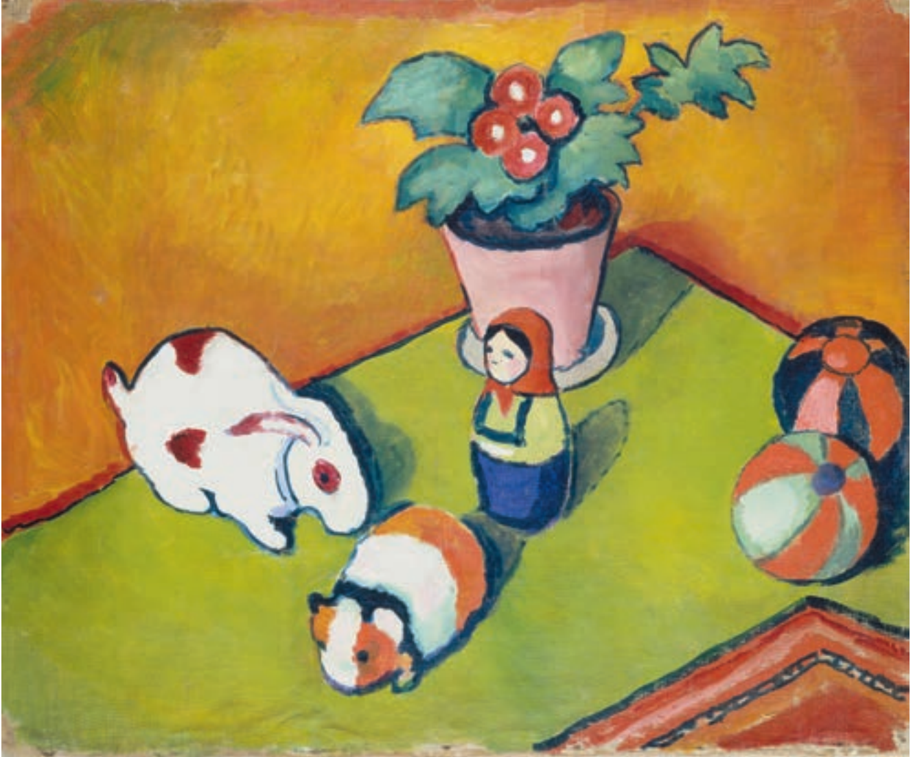
24 August Macke, LITTLE WALTER'S TOYS, 1912