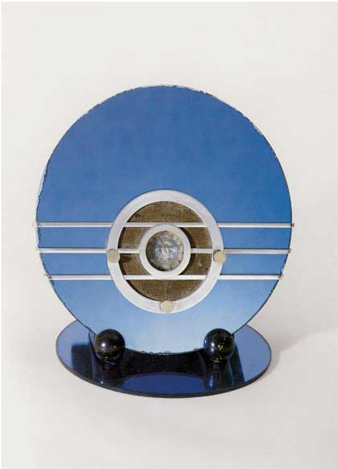
5—Walter Dorwin Teague Sparton "Bluebird" radio 1933, Die Neue Sammlung, Munich

It should be borne in mind that in the New York of the late 1920s and 1930s everyday objects (such as radios) made of Bakelite, garishly colored plastics, and other unusual combinations of materials could be seen and admired en masse (fig. 5), as well as cheap but strikingly styled consumer goods in aerodynamic forms, from automobiles to vacuum cleaners, from hair dryers to the streamlined chairs of Californian designer Kem Weber. A cultivated French globetrotter, in particular, long accustomed to identify this stylistic movement—which would later become known as Art Deco—with the sinfully expensive retro style of a designer like Ruhlmann, would have had difficulty placing these kinds of consumer goods on the same stylistic level as the elite Parisian products. This dilemma of the extraordinary heterogeneity of forms and objects attributed to Art Deco still confronts researchers today.