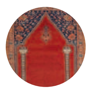
30 • Wool, cotton, silk: the texture of art