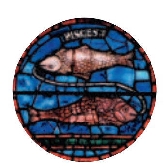
20 • Glass paintings