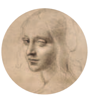
24 • Signs of expression