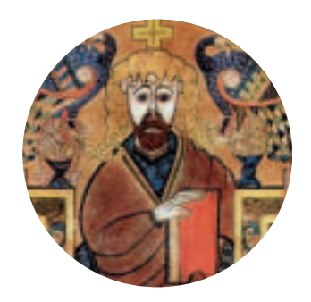
16 • Illuminated art: from parchment to paper