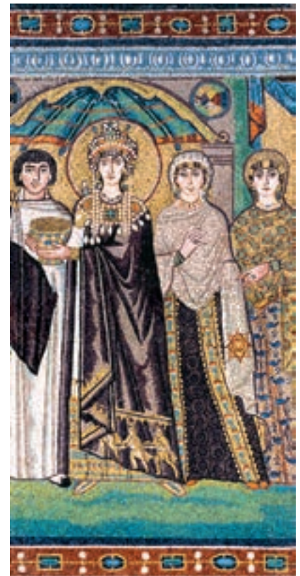
13. Copy of the mosaic of the Empress Theodora from the Basilica of San Vitale, Ravenna, mid-6th century. Execution: Gruppo Mosaicisti dell'Accademia di Belle Arti di Ravenna, 1951, glass, enamel, wood, metal. Ufficio Turismo e Attività Culturali. Comune di Ravenna