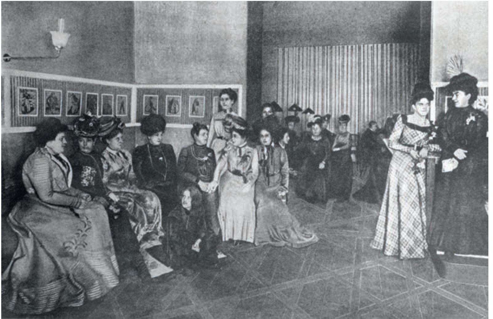
Interior view of the Wiener Frauenclub (Vienna Women's Club), designed by Adolf Loos, 1900. Photograph printed in the journal Das Interessante Blatt , Volume 22, November 1900.