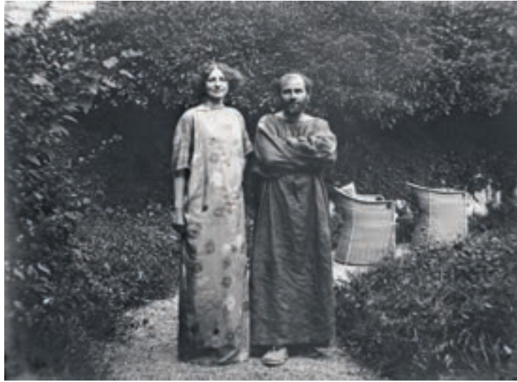
12. Emilie Flöge and Gustav Klimt in the garden of the Villa Oleander in Kammerl/Attersee, 1910.

However, it is not necessarily correct to assume that double standards in Klimt's life were directly and unproblematically reflected in his art. Alongside his remarkable female portraits, women also became the focus of his