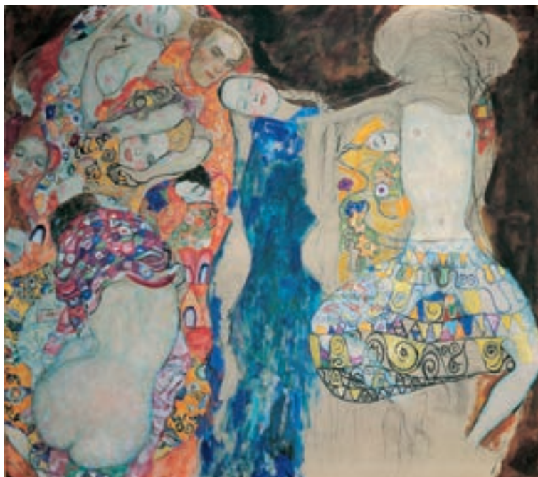
15. Gustav Klimt, The Bride , 1917–18 (unfinished), oil on canvas. Private Collection, on loan to the Belvedere, Vienna

that he neither illustrated feminist books nor openly supported women's political emancipation. However, the fact that feminist sympathizers and progressive thinkers like Berta Zuckerkandl and Marie Lang so wholeheartedly approved of Klimt's art may well relate to his ability to visualize some of the dilemmas that beset women in the modern age. Moreover, his allegories embody a belief in the regenerative force of the female sex—an idea that was current in the feminist sphere, and quite foreign to anti-feminists like Weininger, who associated women with cultural degeneration and decline. Klimt brought his controversial representations of female sexuality into the public domain, and in his layered portraits of women he not only ennobled the female sex but also acknowledged a fracture between social expectations and individual identity—a fracture that would eventually widen into a chasm separating women in the nineteenth century from their twentieth-century heirs.