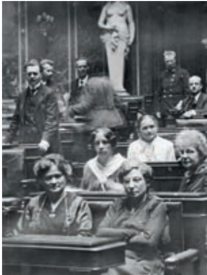
5. Meeting of the constituting National Assembly in Parliament. Sector with women members of the Social Democratic Party from front left: Adelheid Popp, Therese Schlesinger, Anna Boschek, Emmy Freundlich, Maria Tusch, and Amalie Seidel, 1919.