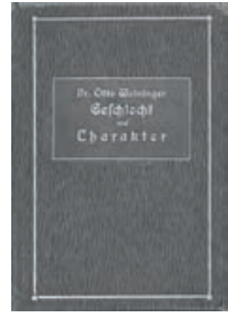
6. Cover of the first edition of Otto Weininger's Geschlecht und Charakter (Sex and Character), 1903 (Vienna/Leipzig: Wilhelm Braumüller, 1903).