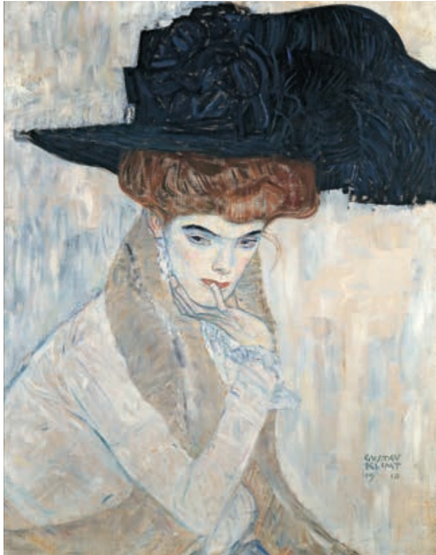
Gustav Klimt, The Black Feathered Hat , 1910, oil on canvas. Private Collection

There is no artist that more typifies the golden age of Viennese art than Klimt, and there is no work that captures the beauty of Viennese women better than the Portrait of Adele Bloch-Bauer I .