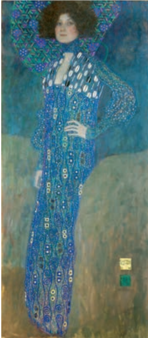
11. Gustav Klimt, Portrait of Emilie Flöge , 1902–03 (with later reworkings), oil on canvas. Wien Museum, Vienna

boundary between the two was not absolutely fixed—in a manner highly characteristic of the double moral standards of his age. 47