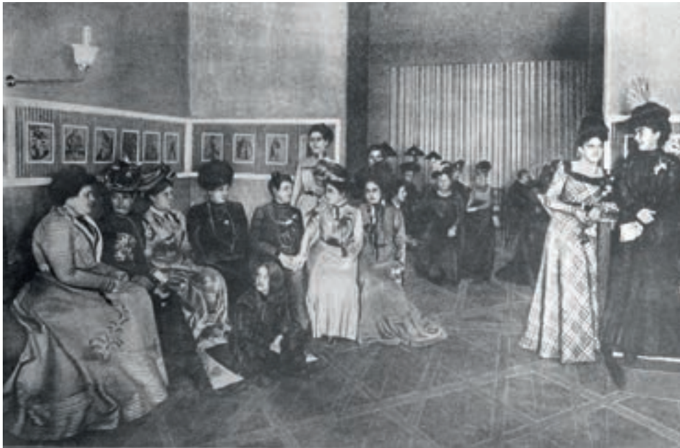
8. Interior view of the Wiener Frauenclub (Vienna Women's Club), designed by Adolf Loos, 1900. Photograph printed in the journal Das Interessante Blatt, Volume 22, November 1900.