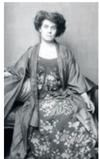
9. Berta Zuckerkandl, 1908.

Progressive artists and designers took part, alongside the Zuckerkandls, in various pedagogical projects initiated by the women's movement. In the same year as the Secession opened its doors to the public, the Art School Association for Women and Girls (Verein Kunstschule für Frauen und Mädchen) was co-founded by Rosa Mayreder, who was not only a talented author but also the first woman member of the Vienna Club of Watercolor Artists. This school offered the first opportunity in Vienna for women to be trained as professional artists and commercial designers. 38